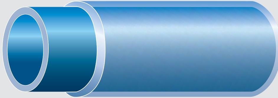
EFEP co-extruded as an outer layer